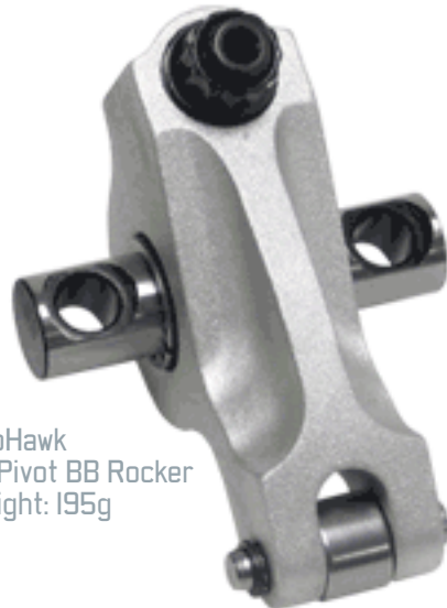
MoHawk 1.650 Pivot BB Rocker Weight: 195g

JESEL's MoHawk rigid center beam rocker is the ultimate design incorporating stiffness, strength and lightweight into a single package.