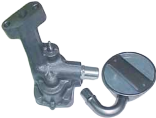
Melling High Performance Oil Pump A