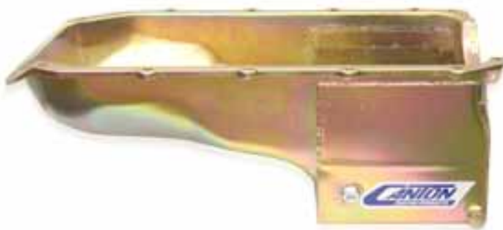
A Canton Pontiac Road Race Pan for GTO'S