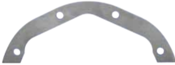
AllPontiac Oil Pan Spacer A