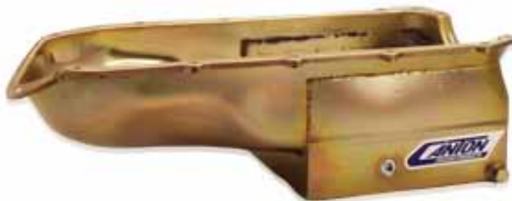
B Canton Pontiac Road Race Pan

Requires #CAN-15451 pickup (3/4" O.D.) for High Pressure Pump #M54DS