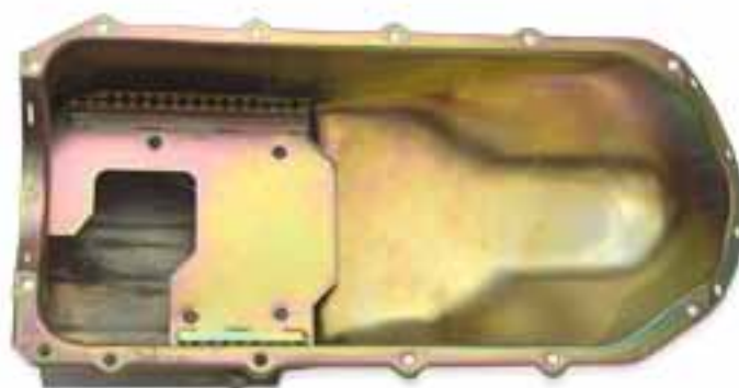
A Canton Pontiac Road Race Pan for GTO'S (inside)